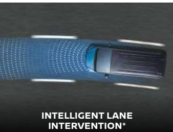
INTELLIGENT LANE INTERVENTION* Automatically helps keep your vehicle centred in its lane by detecting unintentional drift and gently guiding you back when lane markings are clear.