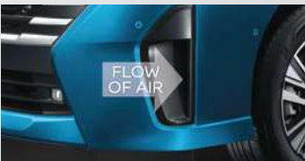
Reduced Sway Improved aerodynamics with air curtain slots to enhance stability, quietness and driving efficiency.