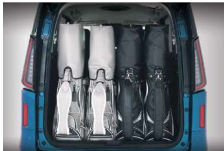
Smart, flexible storage solutions to fit every lifestyle needs