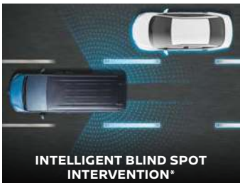
INTELLIGENT BLIND SPOT INTERVENTION* If the driver still attempts to change lanes after being warned, the system will automatically steer the vehicle back into its lane to avoid a collision.