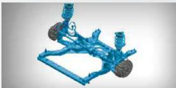
Newly Designed Front Suspension System Delivers precise control and reduced body roll for a smoother, more stable and comfortable ride.