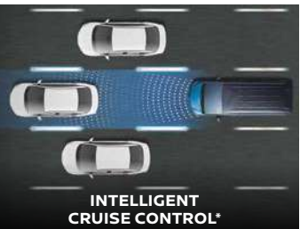
INTELLIGENT CRUISE CONTROL* Automatically adjusts speed to maintain a safe distance, reducing driver fatigue during long journeys.

Experience a new level of intelligent driving with Nissan ProPILOT. With just a touch of a button on the steering wheel, ProPILOT seamlessly assists with steering, braking and acceleration, to help you maintain a safe distance, stay centred in your lane and enjoy a smoother, more confident drive.