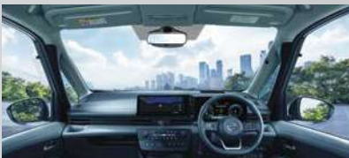
Calming and Stress-free Environment Large windows enhance visibility for an excellent view from every seat and a quieter cabin with noise insulated acoustic glass ensuring comfort without any claustrophobic feelings.