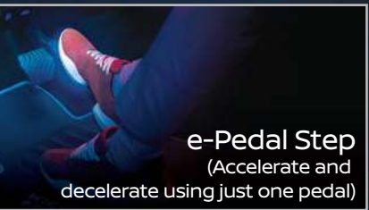
e-Pedal Step (Accelerate and decelerate using just one pedal)