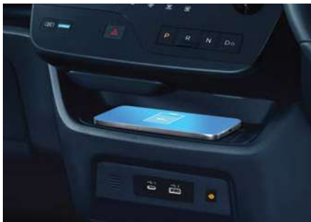
Wireless charger for driver and 6 USB ports provide convenience for every row of seats

Enjoy exceptional comfort in a spacious 7-seater cabin with 1st-row seats and 2nd-row captain seats featuring Zero Gravity technology and 13 seating configurations to suit your travel needs. The spacious interior is complemented by 22 cupholders and storage compartments for an organised and uncluttered ambience.