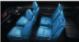
Newly Designed Zero Gravity Seats Experience all-day comfort with reduced fatigue while suppressing head sway.